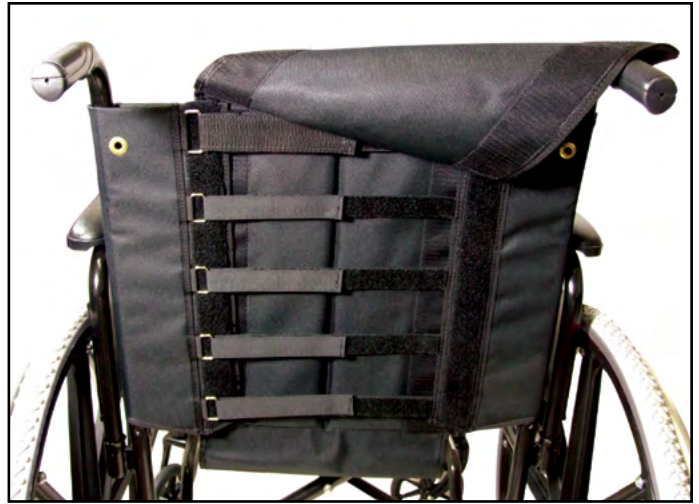
Rear view of Strap Back (with cover open)

The Healthwares Contouring Comfort Strap Back is a flexible contour backrest for wheelchairs incorporating a series of adjustable straps with a zippered padded cover. The adjustable back straps allow contouring for accommodation of fixed or flexible spines/backs, greater trunk stability, active extension of the lumbar, improved head control by stacking the spine in an anatomically correct position, and more room for end users with redundant tissue. Customize the cover padding with thicker foam, gel packs, or air cells for maximizing user comfort and pressure relief. Cover also features a center line stitch allowing for easier folding.