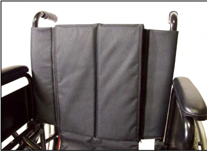
Front view of Strap Back (with cover)