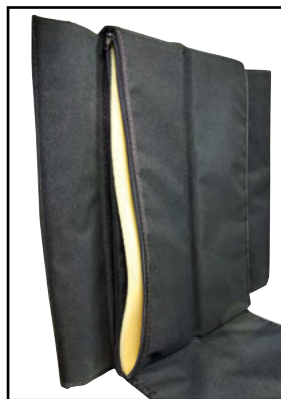
Zippered, customizable padding