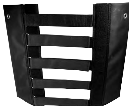
Rear view of Strap Back without cover